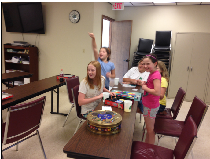
Summer Relief: Lunch and Game Day