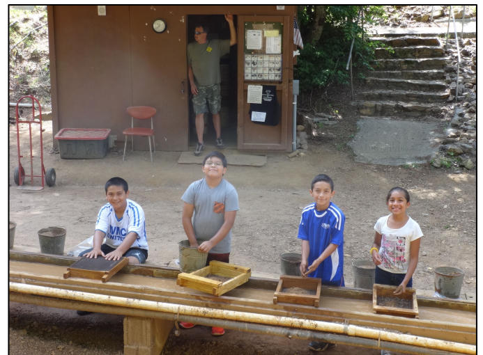
Summer Relief: Gem Mining at Mason Mountain Mine