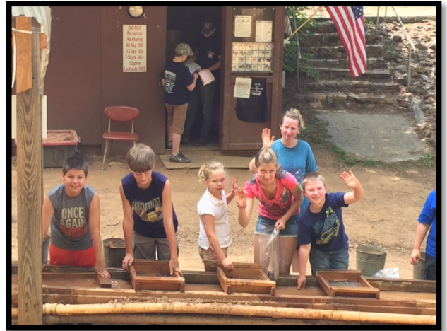
Summer Relief: Gem Mining at Mason Mountain Mine