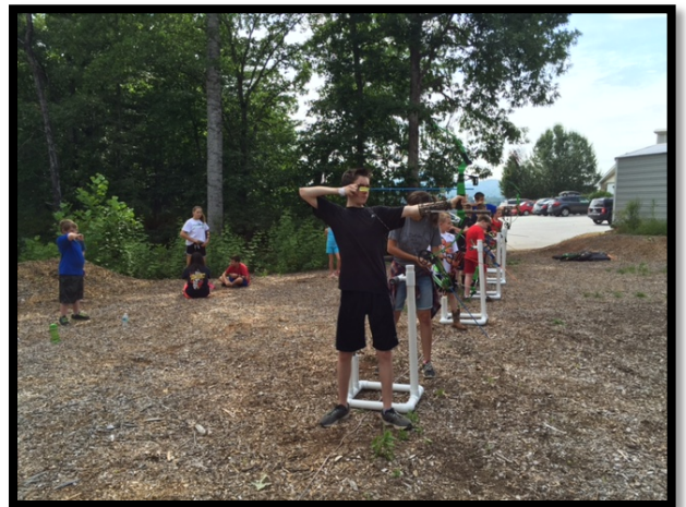
Summer Relief: Archery Practice