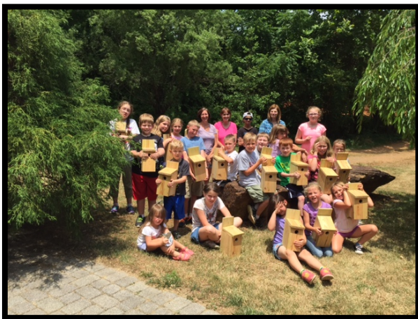
Summer Relief: Making birdhouses at Ornithology Exploration