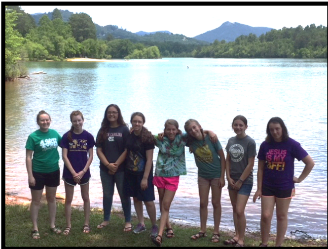
Summer Relief: EPICS camping at Jack Rabbit