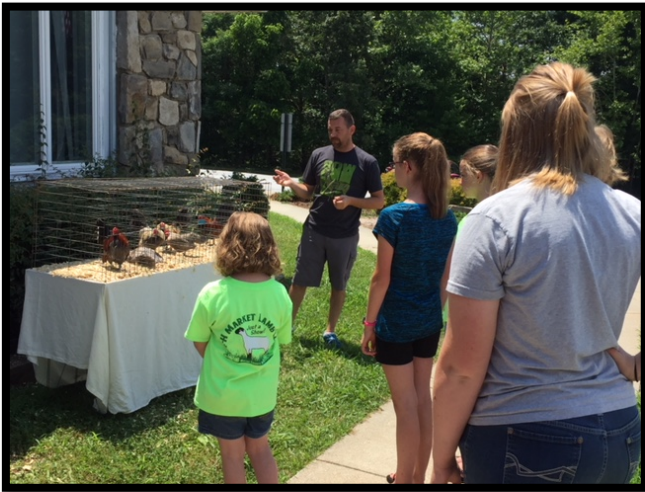
Summer Relief: Youth Poultry School